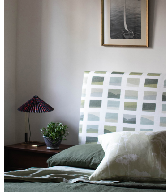
Shown above in Spring