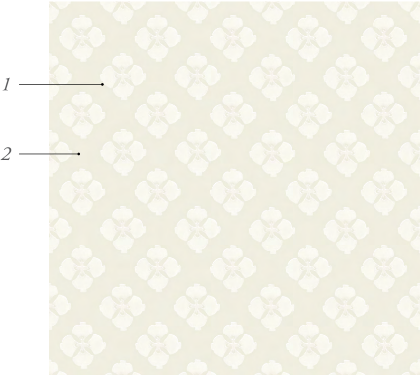
Pictured in Marble

THIS FORM MUST BE COMPLETED WHEN ORDERING A CUSTOM WALLPAPER.