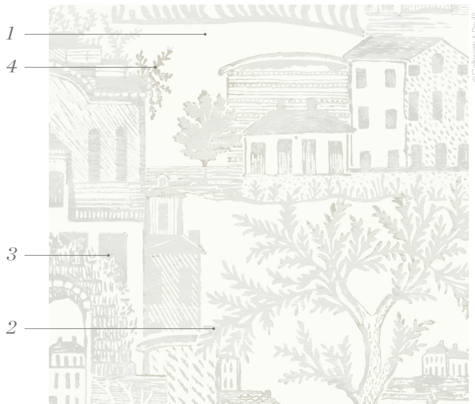
Shown above in Cloud