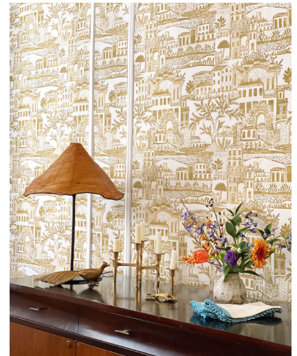
Shown above in Honey