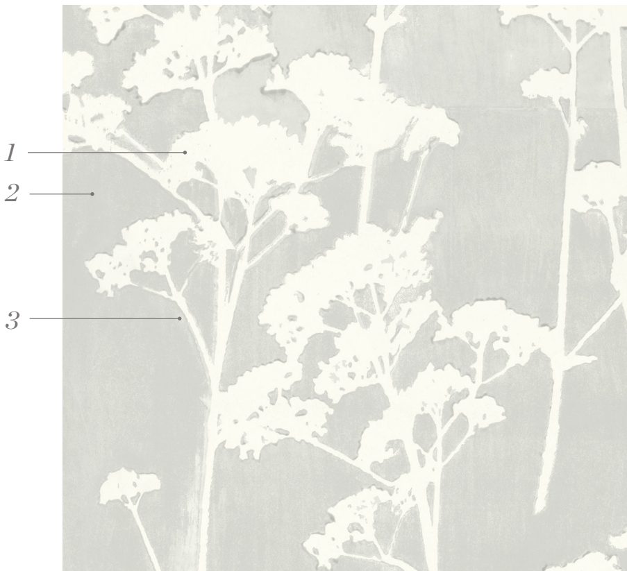
Shown above in Stainless