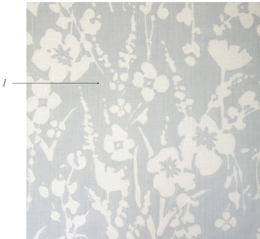
Shown above in Arctic on Logan White Linen