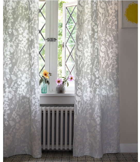
Shown above in Arctic on Logan White