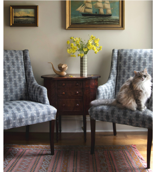
Shown above in Cadet on Bartram Natural Linen