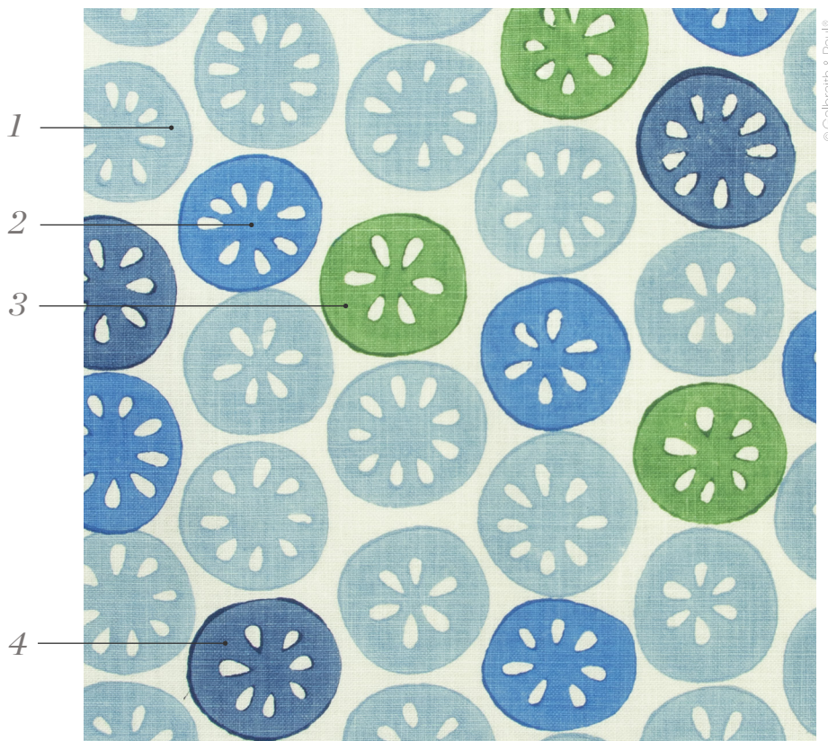
Shown above in Capri on Logan White Linen