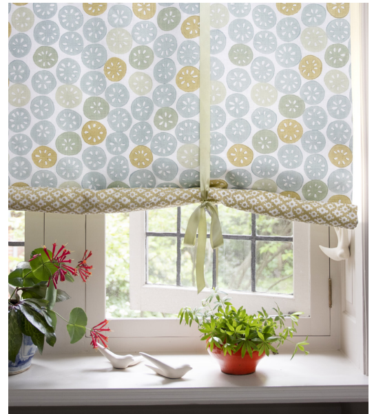
Shown above in Mineral