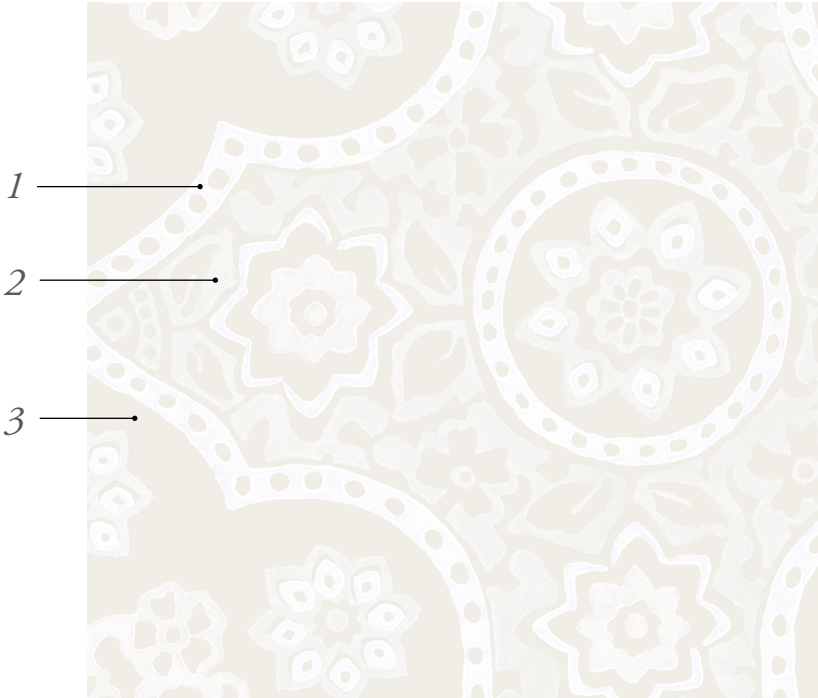
Pictured in Alabaster

THIS FORM MUST BE COMPLETED WHEN ORDERING A CUSTOM WALLPAPER.