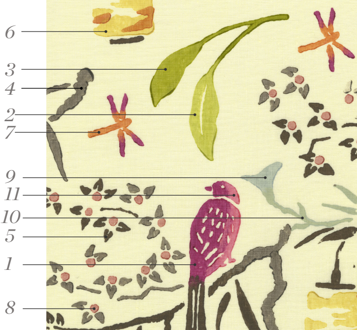
Shown above in Mulberry on Logan Cream Linen