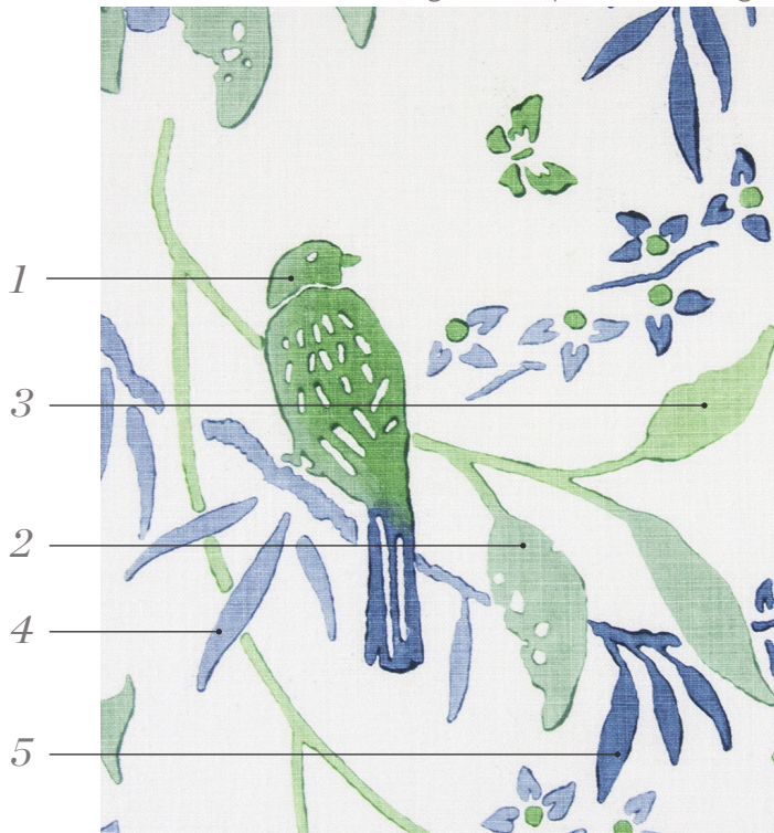
Shown above in Malachine on Logan White Linen