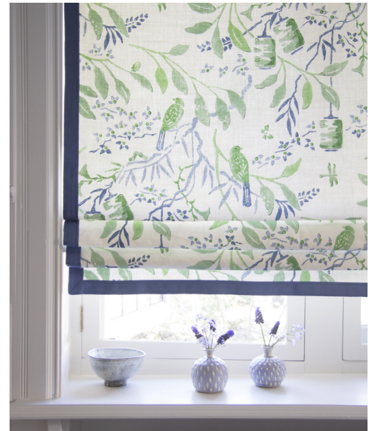
Shown above in Malachite on Logan White Linen