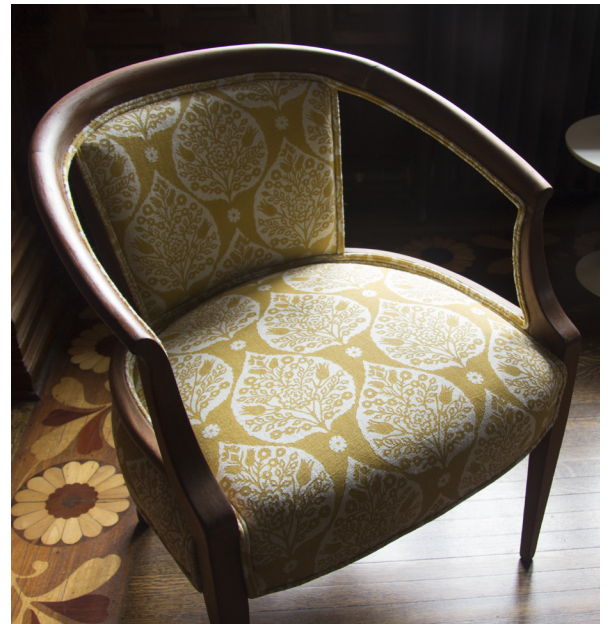
Shown above in Saffron

Ground Cloth Bartram Linen or Logan Linen