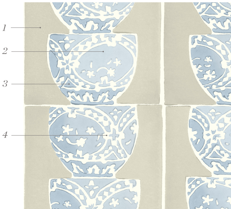
Shown above in Harbor