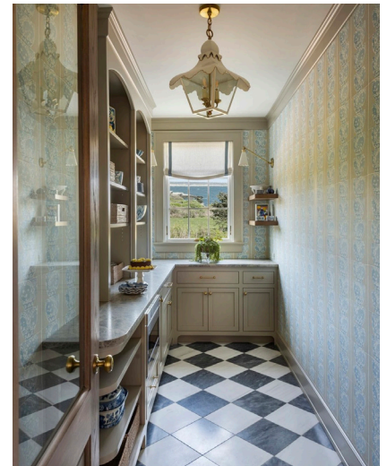
Shown above in Fin Room Design by Taste Design