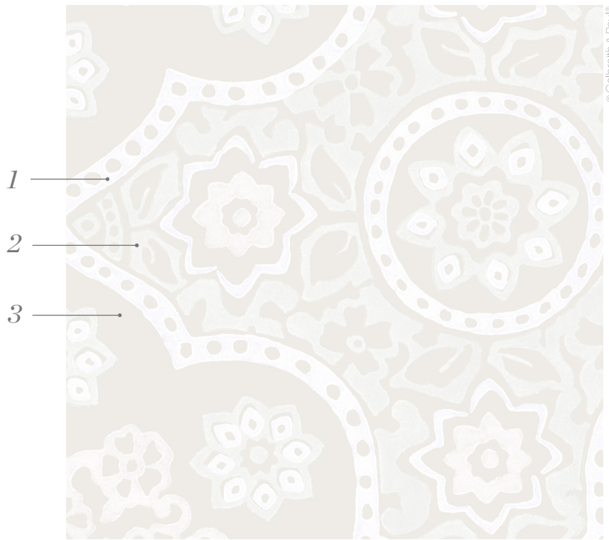
Shown above in Alabaster

This form must be completed when ordering a custom wallpaper. 5 yard minimum