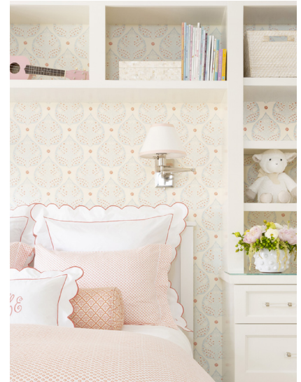
Shown above in Salmon Room Design Lauren Evans Interiors