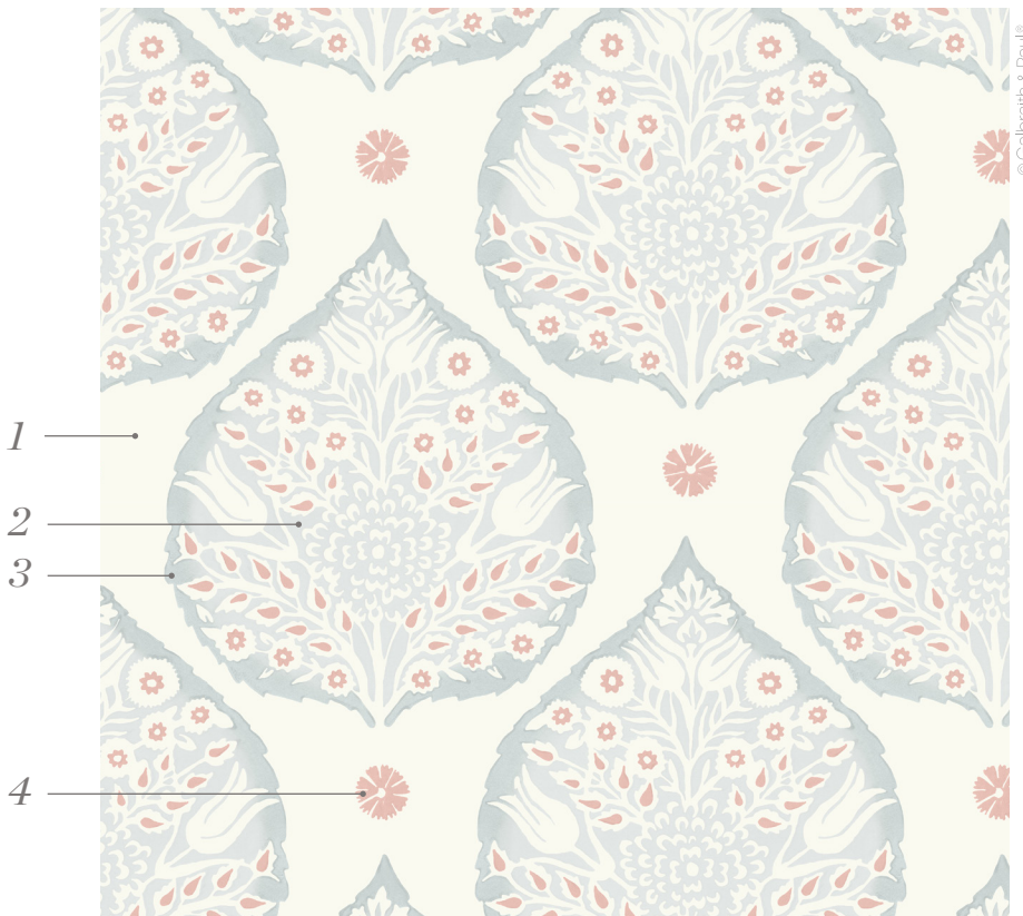
Shown above in Salmon