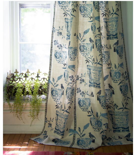
Shown above in Light Azure