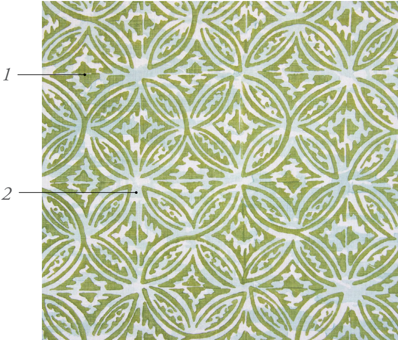
Casita B in Kiwi on Logan White Linen

THIS FORM MUST BE COMPLETED WHEN ORDERING A CUSTOM FABRIC.