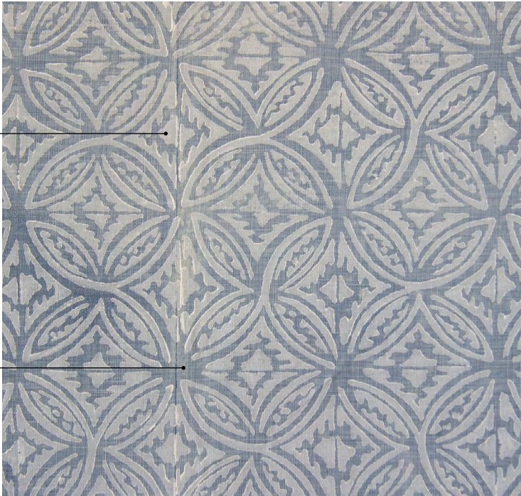
Casita C in Denim Wash on Logan White Linen

THIS FORM MUST BE COMPLETED WHEN ORDERING A CUSTOM FABRIC.