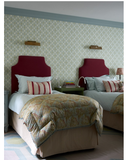
Shown above in Frost Room Design by Nicola Harding & Co.