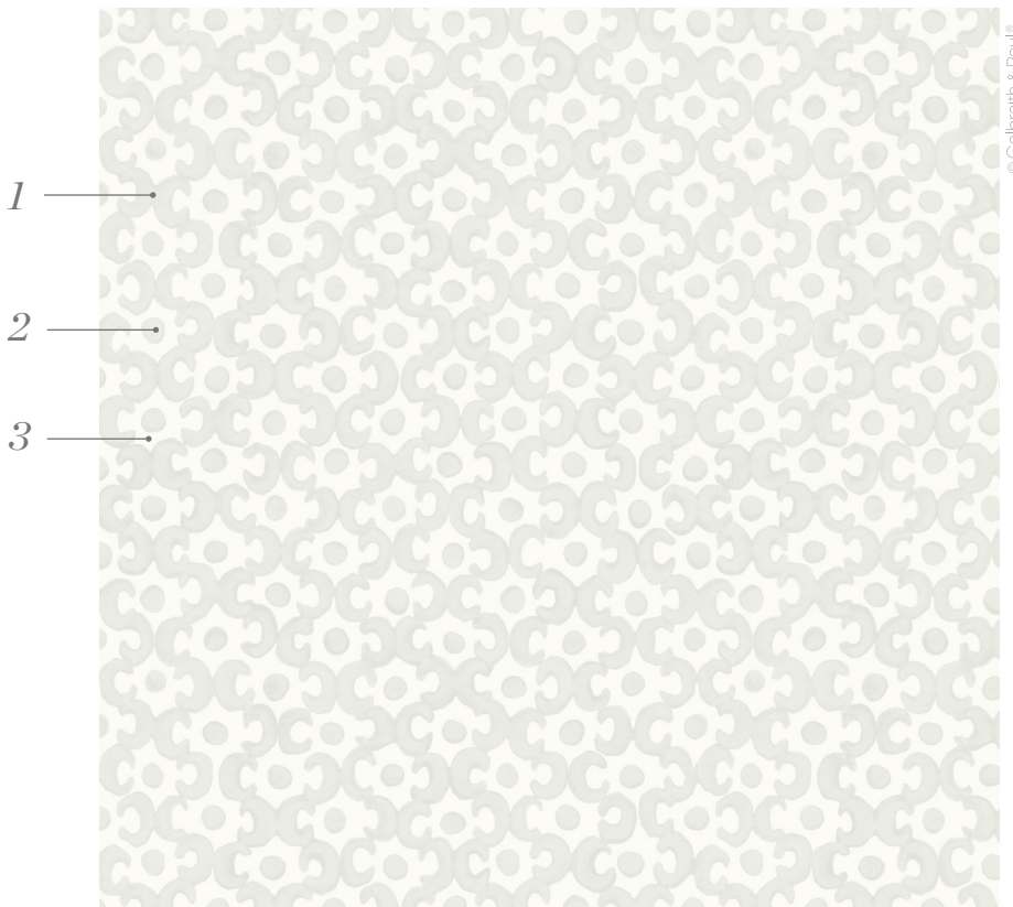
Shown above in Cloud