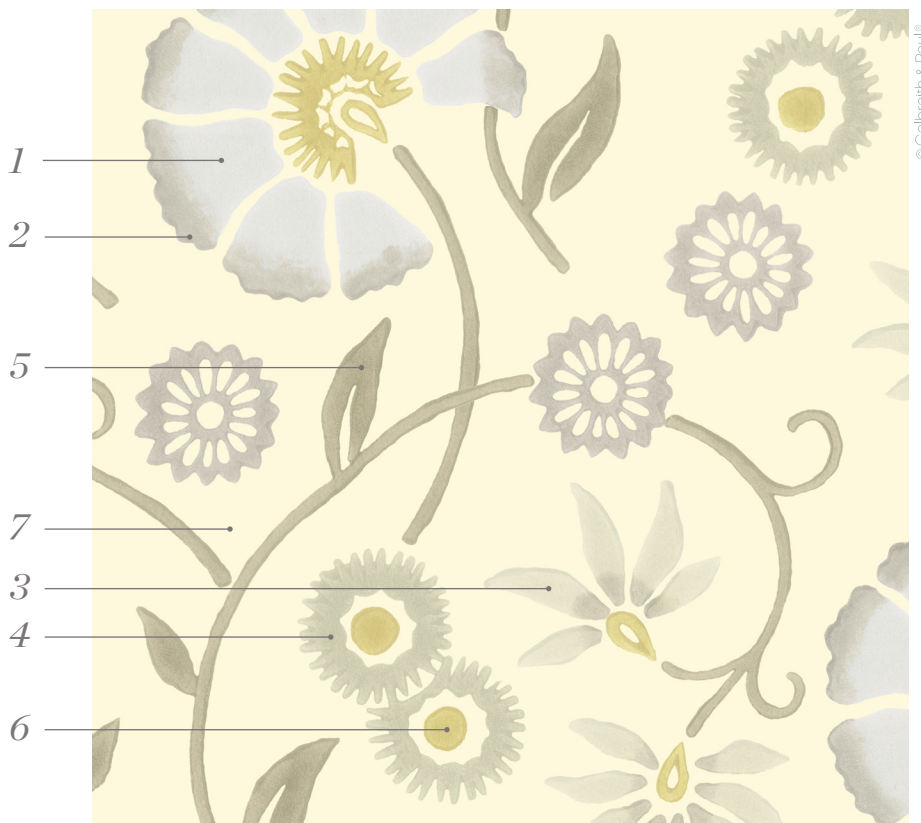
Shown above in Dove Gray