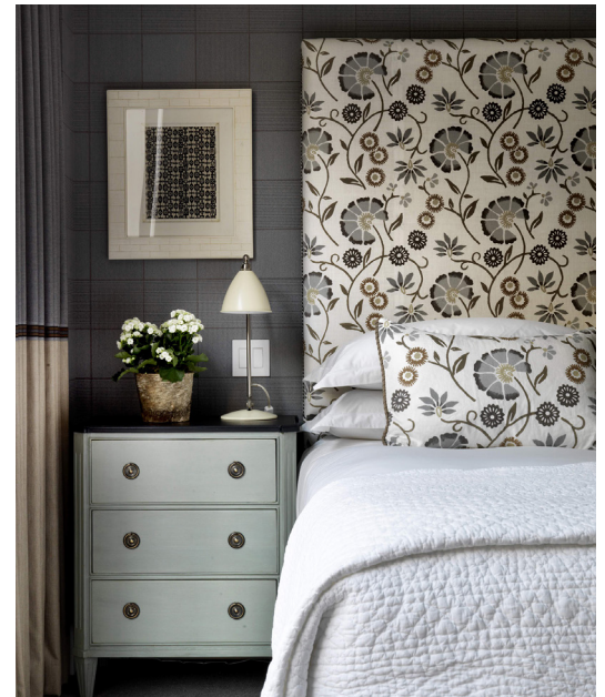
Shown above in Stone

Ground Cloth Logan Linen or Bartram Linen