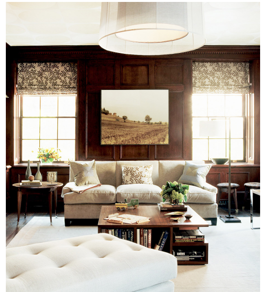
Shown above in Tobacco Room Design by Eve Robinson