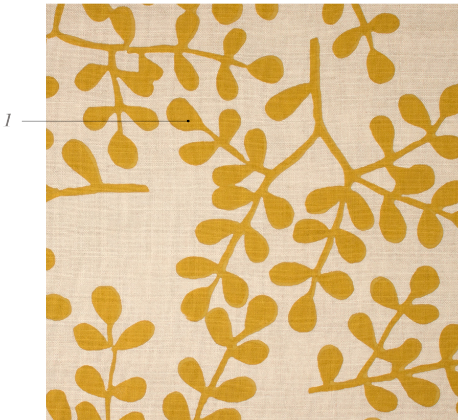
Shown above in Maize on Logan Natural Linen