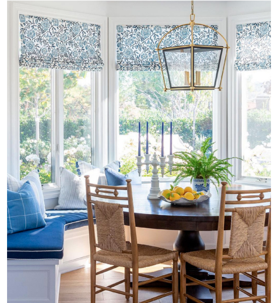
Shown above in Periwinkle Room Design by Leane Cole Interior Design