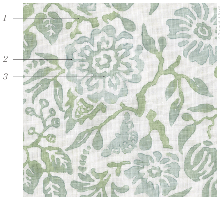
Shown above in Mineral on Logan White Linen