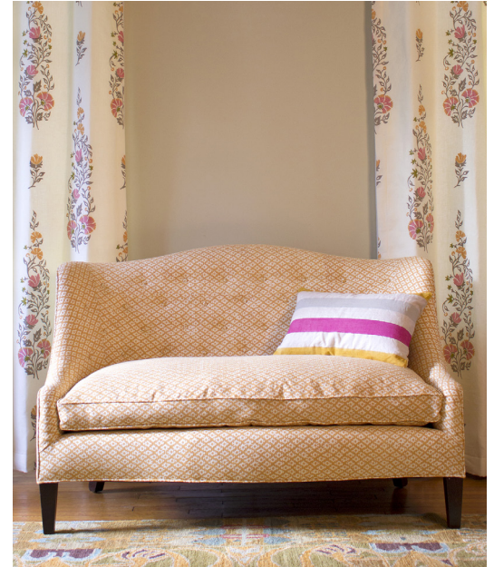
Shown above in Fawn on Logan Cream Linen