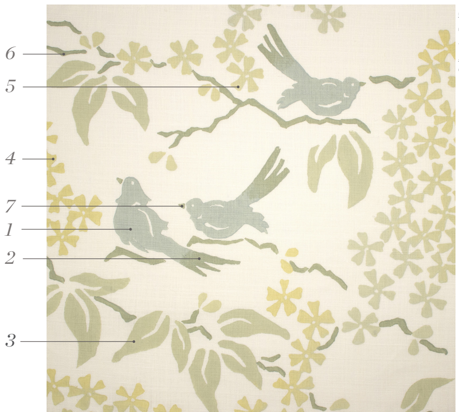
Shown above in Mineral on Logan White Linen