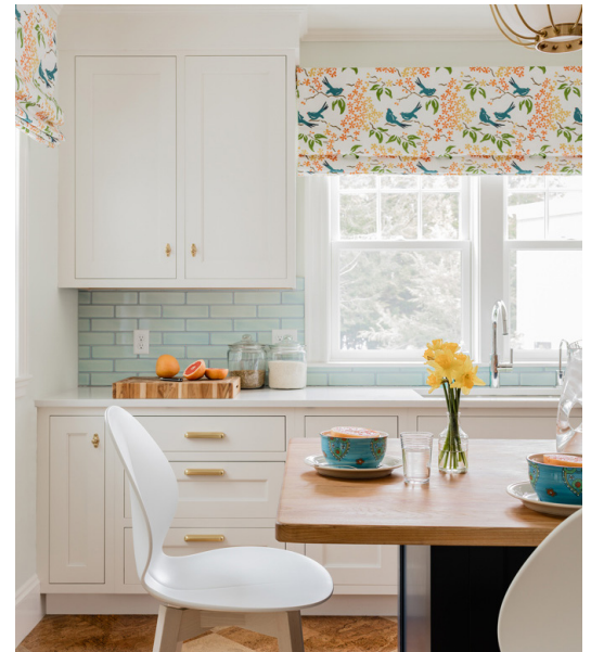
Shown above in Lake Room Design by Kelly Rogers Interiors